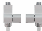
Radiator valve, square, angled